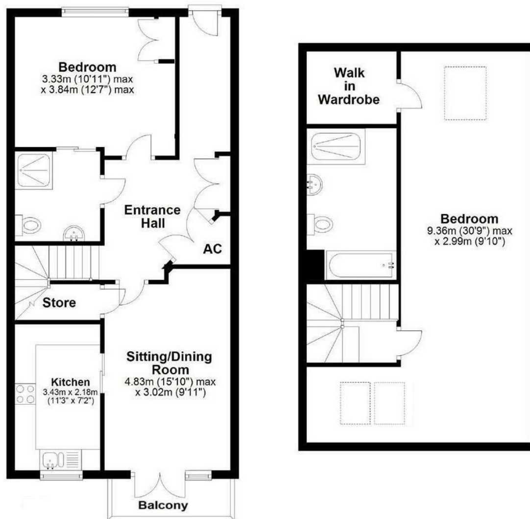
Illustration for identification purposes only, measurements are approximate, not to scale. Plan produced using PlanUp.

Disclaimer These particulars, whilst believed to be accurate are set out as a general outline only for guidance and do not constitute any part of an offer or contract. Intending purchasers should not rely on them as statements of representation of fact, but must satisfy themselves by inspection or otherwise as to their accuracy. No person in this firm's employment has the authority to make or give any representation or warranty in respect of the property. All measurements and distances are approximate only. Your home is at risk if you do not keep up repayments on a mortgage or other loan secured on it.